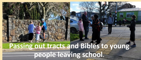
Passing out tracts and Bibles to young people leaving school.